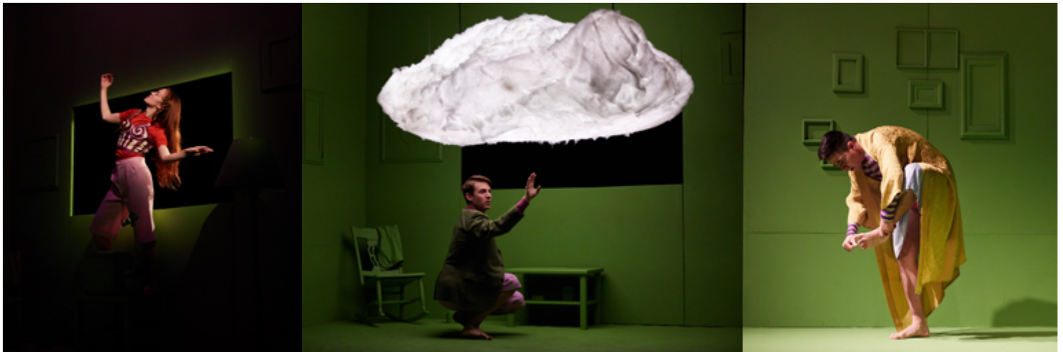
photos from the filming of Full View